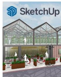
SketchUp Studio for Students 1-Year License Download $55.00